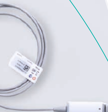
Hematocrit/Oxygen Saturaton (H/S) Probe