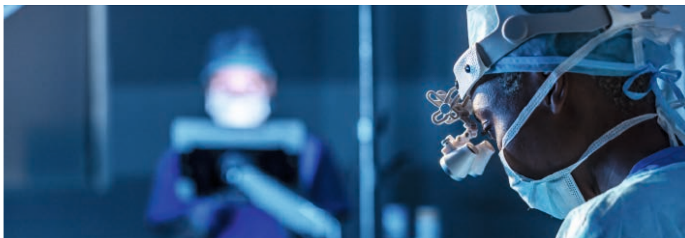
CDI OneView Monitoring System.