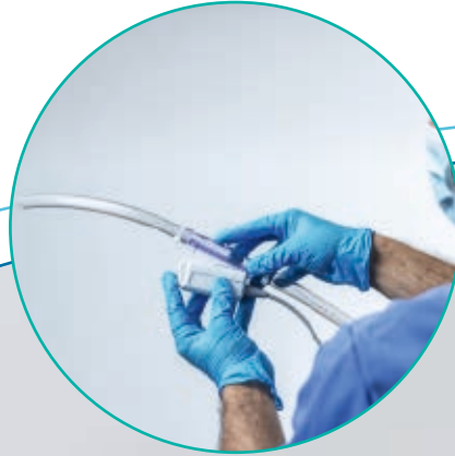
The H/S Cuvette is installed into the H/S Probe.