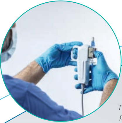
The Shunt Sensor is placed in the BPM.